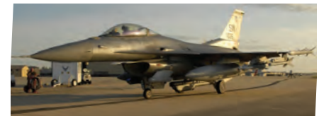
Preserved buffer land benefits vehicle maneuver exercises (top) and F-16 training (bottom).